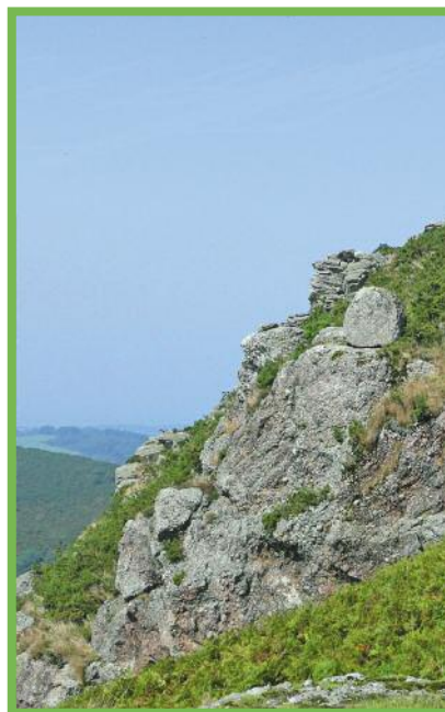
Rocher des Perdrix

sloping track offering some attractive views over the Bidassoa valley. Follow the signposts to the level of the power line 2 and turn left to return to the village. 2h30